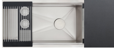
Graphite Wood Composite